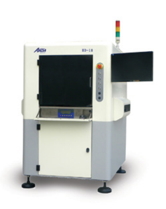
TDS-350S TABLE TOP DISPENSER